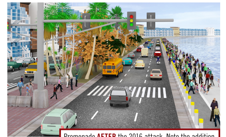
Promenade AFTER the 2016 attack. Note the addition of bollards, concrete barriers, and vegetation.