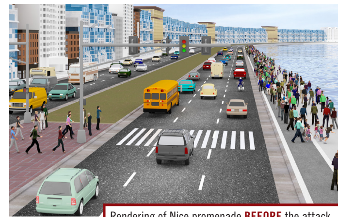
Rendering of Nice promenade BEFORE the attack.